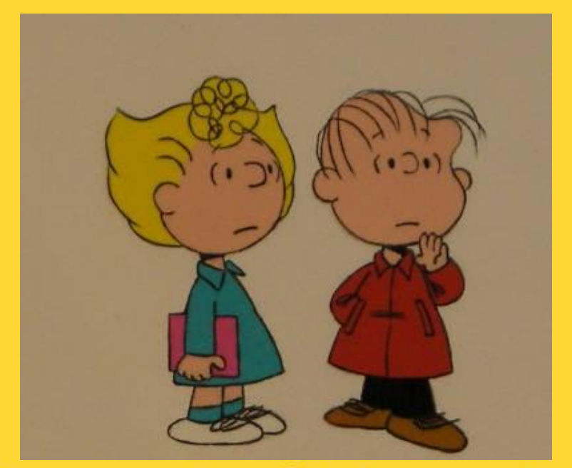
Sally sings to Schroeder about her silly life philosophies