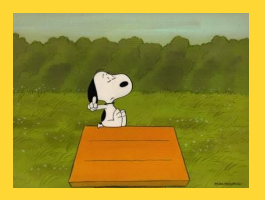
Snoopy sings a song about suppertime and how much he loves to eat